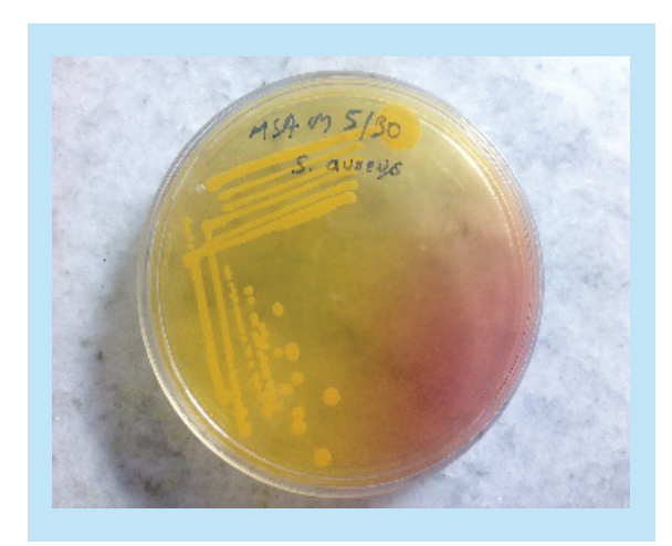
Figure 3. Photograph of Staphylococcus aureus in mannitol salt agar media.

cefoxitin (30 \mu ), penicillin (10 \mu ), ofloxacin (5 \mu ), erythromycin (15 \mu ), amoxicillin/clavulanic acid (15 \mu ), ciprofloxacin (5 \mu ), cotrimoxazole (25 \mu ), ampicillin (10 \mu ), amoxicillin (10 \mu ), cloxacillin (5 \mu ), azithromycin (15 \mu ), tetracycline (30 \mu ), gentamicin (10 \mu ) and vancomycin (30 \mu ). For identification of MRSA, cefoxitin disc (30 \mu ) was used. A zone of inhibition less than 22 mm or any discernible growth within zone of inhibition by