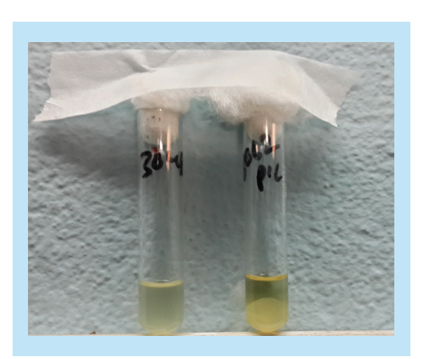
Figure 1. Photograph of tube coagulase test results (A) -ve and (B) +ve.